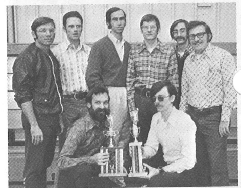
Nodak Bombers, Highliner Volleyball League Champions and first place winners at the MSR.